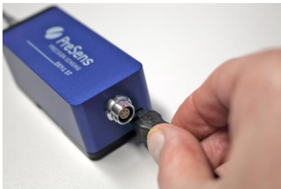
Fig. 2 Connecting the USB cable