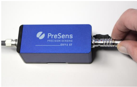
Fig. 3 Connecting the temperature sensor